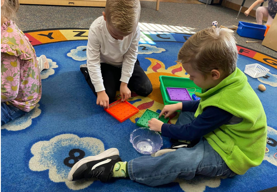
Students in the PM 4/5's class use geo boards during free choice.