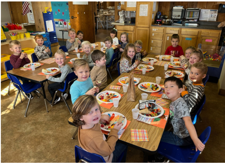
The MTR 4's class enjoys a Thanksgiving treat together.

Thank you all for joining us for Fall Conferences. This is a special time for you and your child's teachers to sit and chat for a bit about your student's progress, goals and plans for next year. We hope you enjoyed this time and will not hesitate to reach out with questions or concerns between now and the spring time when we will hold another (optional) conference opportunity.