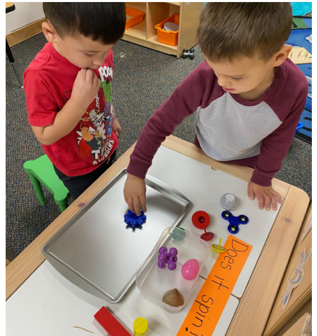
Students enjoy exploring centers during free choice. Does it spin?

Lastly, if you plan on returning next year, note we will begin to take registration when we return in January (January 3rd is the priority registration date. Registration will open for the general public on January 9th.). We hope you all have a wonderful December and a beautiful holiday together with your family.